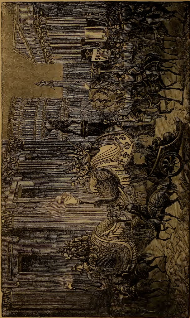
THE ELEPHANTS MADE TORCH-BEARERS.